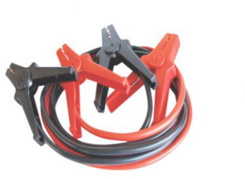
JA-056312GYS Jump Lead Set