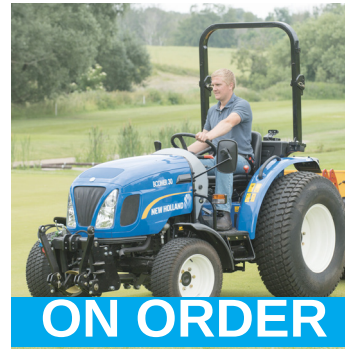
Boomer 30 HST 21009308 NEW