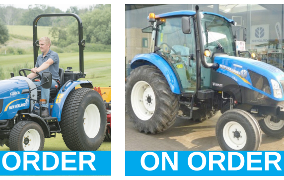
T4.55 2WD 21009127 NEW