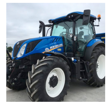
21009171 EX-DEMO - 67 Reg