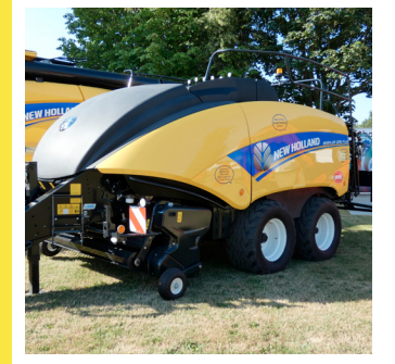
BB1290 Plus 21009225 NEW