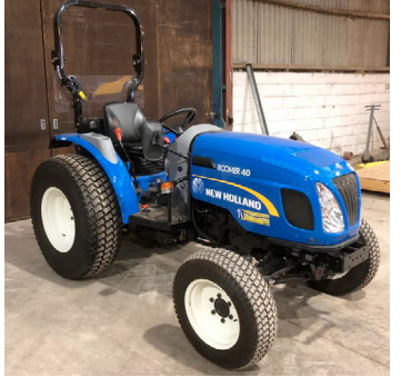
Boomer 40 Syncro 31008778 EX-DEMO