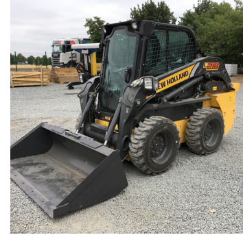
L218 Skidsteer 21009212 NEW