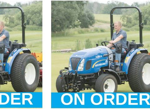
Boomer 40 HST 21009273 NEW