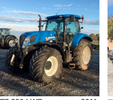
2011 USED - 3600 Hours