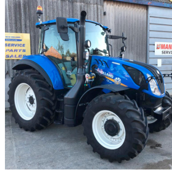
T5.120 E/C 21009129