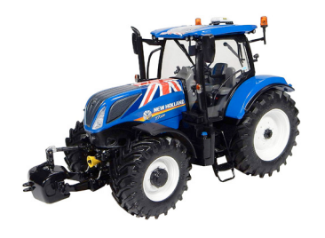
JA-UH4901 T7.225 UK £54.12 + VAT