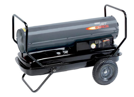
125,000 BTU (36kW) Stock No. 32285

175,000 BTU (51kW) Stock No. 32284 £415.00