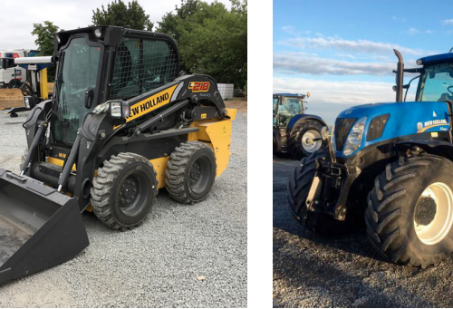
T7.220 LWB 41009269