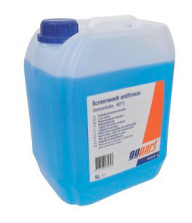
JA-48005GP Screen Wash 5L