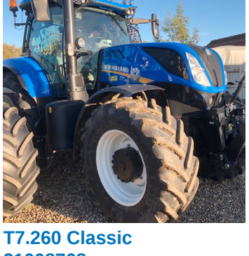
21008768 EX-DEMO - 18 Req