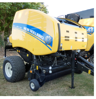
RB150 Rotor Feeder 21009307 NEW