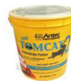
Tomcat 1598 10kg Pellets £70.71 + VAT