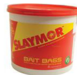
Slaymore 13163 6kg Rat Pack £42.86 + VAT