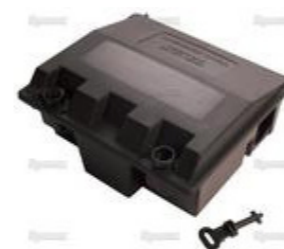
Sorex 1562 Bait Box £13.26 + VAT