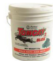
Tomcat 1599 8kg Blocks £67.86 + VAT