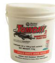
Tomcat 1560 4kg Rat Pack £48.73 + VAT