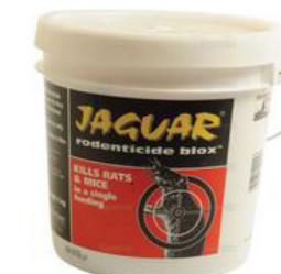
Jaguar 20779 4kg Ratbait £53.00 + VAT