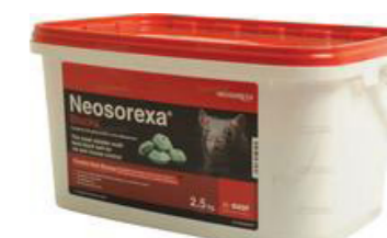
Neosorex 1537 2.5kg Blocks £44.29 + VAT