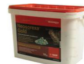
Neosorex 1533 10kg Ratbait £58.57 + VAT