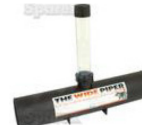
Sorex 18194 Wide Piper £21.17 + VAT