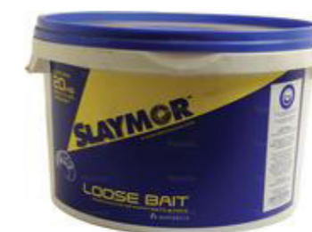
Slaymore 13161 20kg Rat Bait £75.71 + VAT