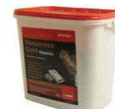
Neosorex 1532 5kg Rat Pack £44.29 + VAT