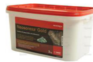
Neosorex 1531 3kg Ratbait £25.72 + VAT