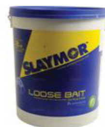
Slaymore 13160 12kg Rat Bait £51.43 + VAT