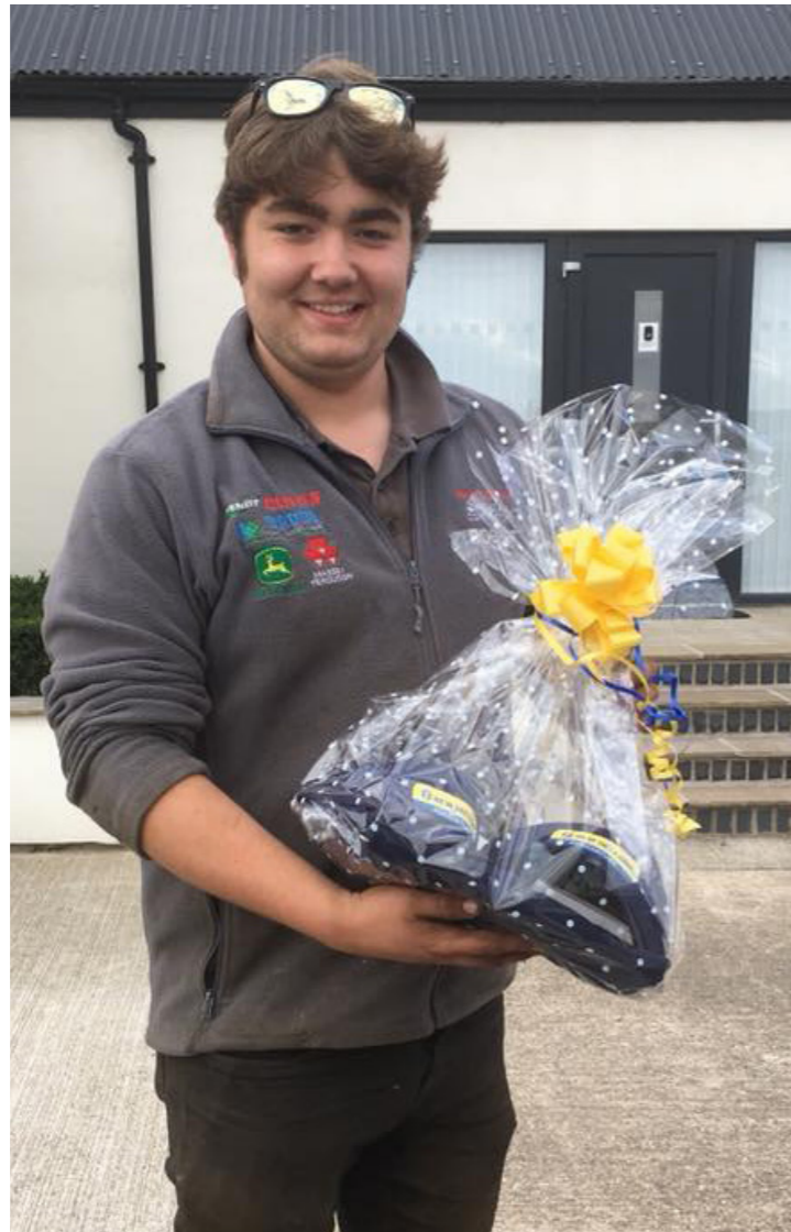
Look out for future competitions on our Facebook page.