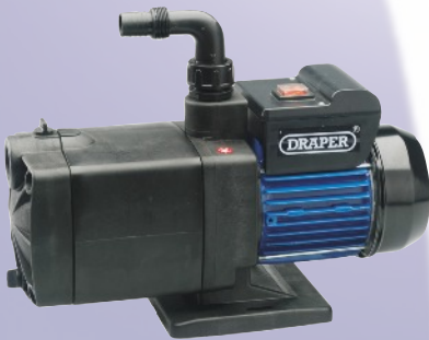
Draper surface mounted pump 56227 £75.00 + vat