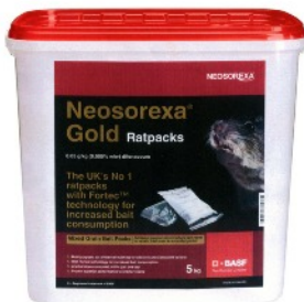
5 kg Rat packs £47.69 + vat

All sales of professional packs will need a farm assurance scheme number or a CRRU approved certificate.