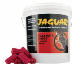
4 kg Blocks £49.01 + vat