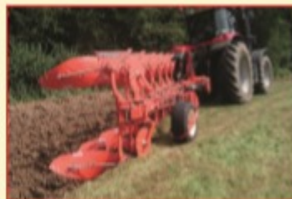
Mounted Reversible Ploughs