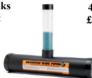
Bait tube £14.14 + vat