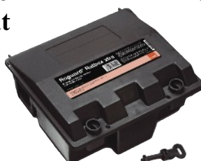
Bait box £13.92 + vat