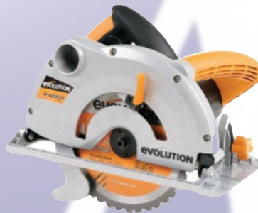
EP-EVORAGE1851 110 Volt Circular saw £50.00 + vat