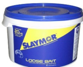
20 kg Loose £75.71 + vat