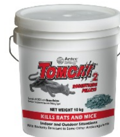
10 kg Loose £69.02 + vat