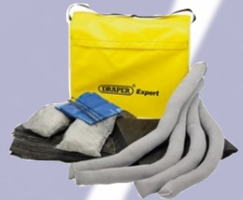
Draper spill kit DR-21582 £60.00 + vat