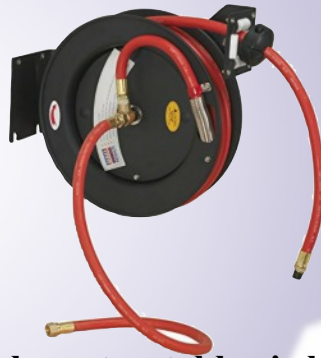
Sealey retractable air hose SA84 £50.00 + vat