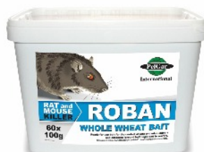
6 kg Place packs £35.22 + vat