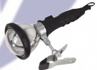
Inspection lamp JS-ML24WP £15.00 + vat