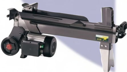
EP-NMALH522 5 Ton Woodstar Log splitter £110.+ vat