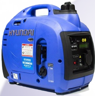
Hyundai generator HY1000SIHX53 £300.00 + vat