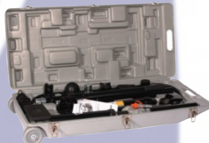
Body repair puller kit SI-03818 £80.00 + vat